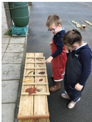
Using a tens frame outside