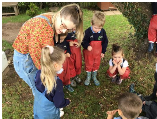
Finding a dead mouse outside (Dave the mouse!)