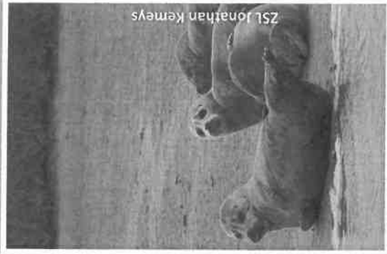
ZSL Jonathan Kemmays

Good news! The Thames Estuary is now teeming with seals! Only 60 years ago, this stretch of water, where the Thames River meets the sea, was terribly polluted. The Thames was so dirty it was considered 'biologically dead', which means it had no life in it. A new survey has discovered 3,500 blue and grey harbour seals living in the estuary. This shows that the Thames is now much healthier and has lots of fish living in it for the seals to feed on.